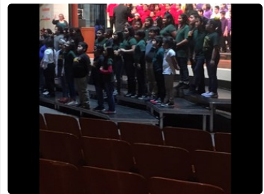
Briscoe Choir Performing at Burbank